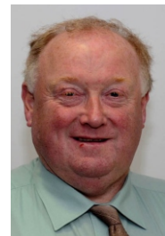
Cllr. Tyssul Evans Llangydeyrn (Plaid Cymru)